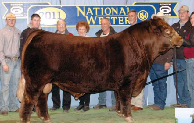
Sire of Lot 20 embryos, MAGSWL Usual Suspect 538U.