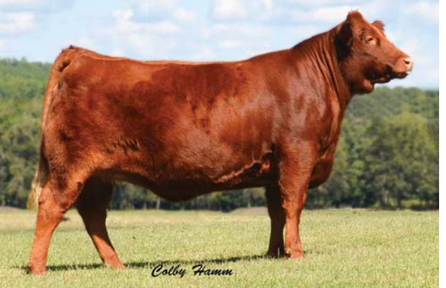
Dam of Lot 22 embryos, MAGS Zips Ice.