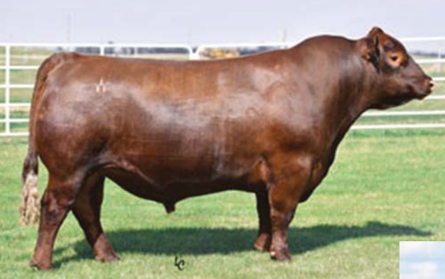
Sire of Lot 22 embryos, Andras New Direction R240.